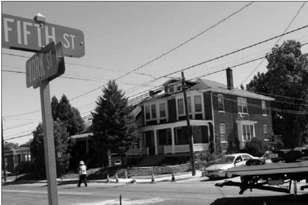
CLEANUP — A flatbed truck removes a motorcycle from an accident scene at Fifth and York streets in Gettysburg Wednesday afternoon.