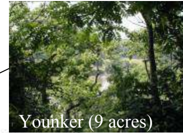
Younker (9 acres)