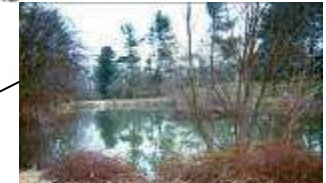
Stockton (8.5 acres)