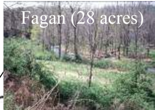
Fagan (28 acres)